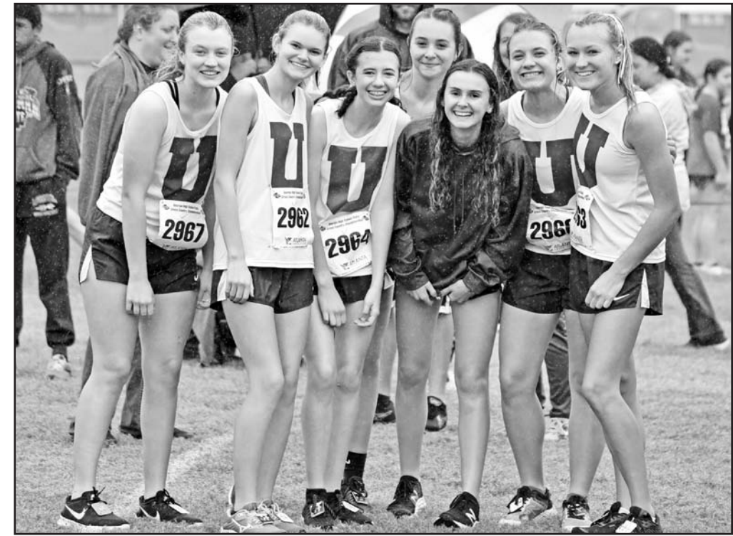
The Union County ladies cross country team at the starting line prior to Saturday's State Championship race at Carrollton High School.