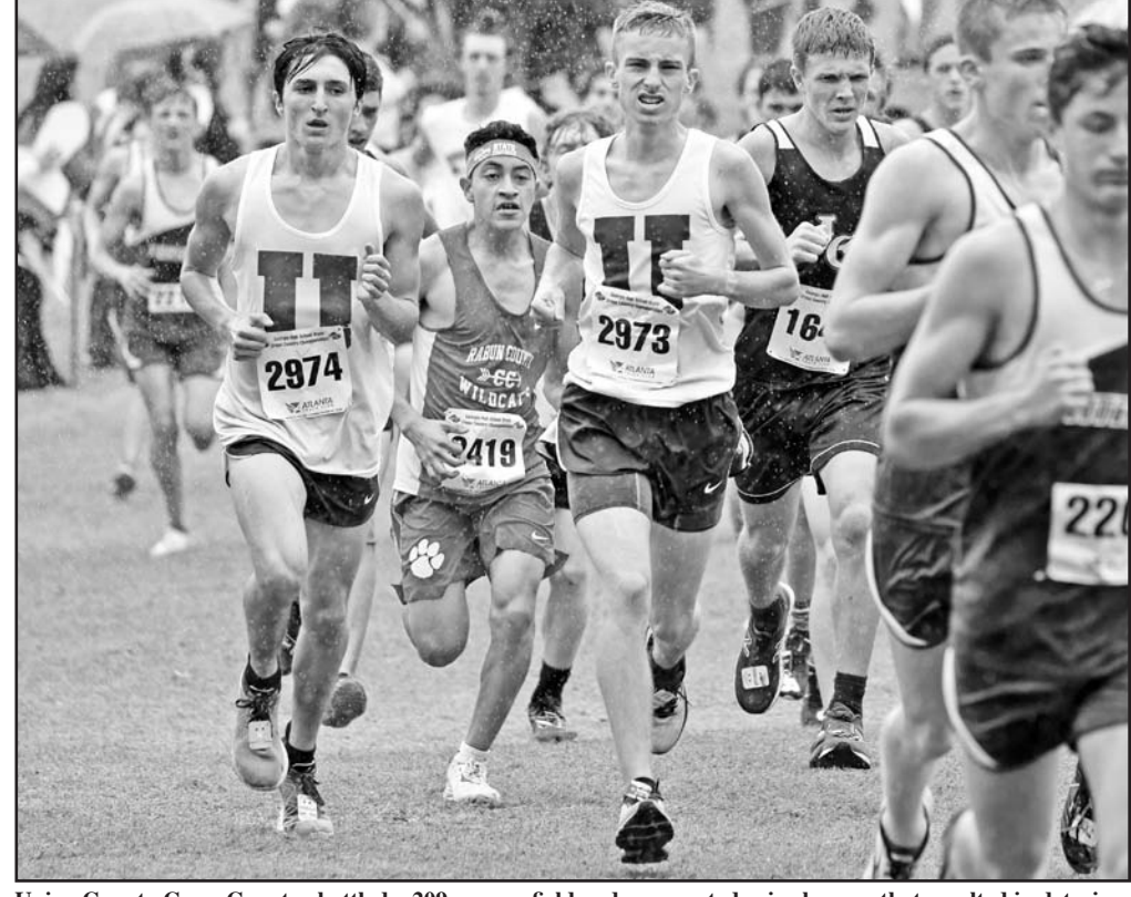
Union County Cross Country battled a 209-runner field and unexpected rain showers that resulted in deteriorating course conditions throughout the afternoon.