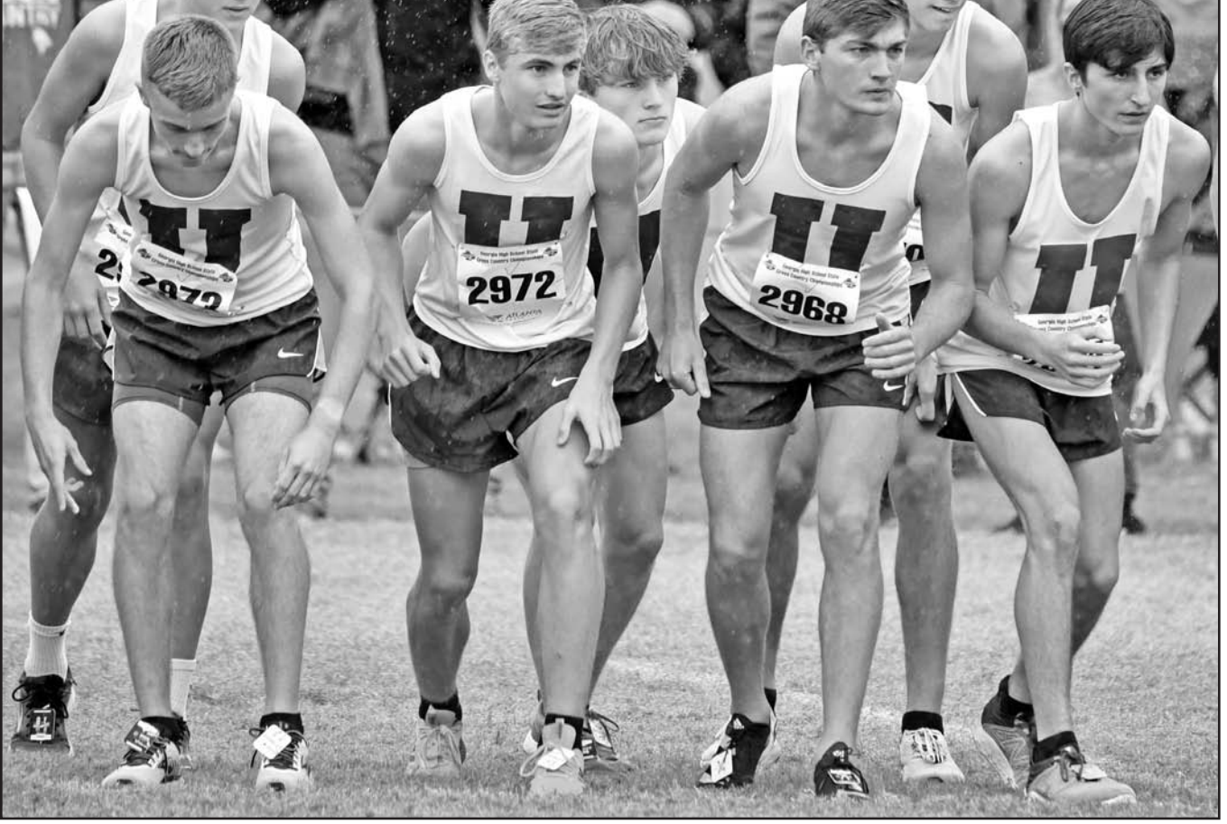
The Union County men take their positions at the starting line prior to Saturday's Class AA State Championship race.